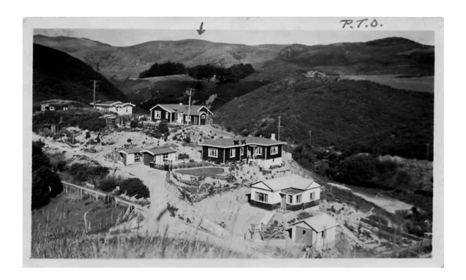
A group of Fitt, van Weede and Wright homes in about 1943 This photograph shows the intersection of present day Glenside road and Stebbings Road with the driveway beside the fence which today, leads down to vacant farmland. The

farmland was the site of the Glenugie homestead from 1886 until 1979, when it was pulled