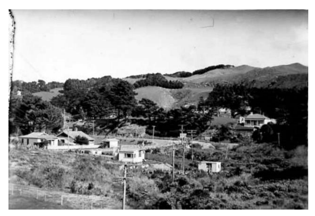
This view, if taken today, is looking south toward the intersection of Middleton Road [then Glenside Road] and Stebbings Road [now Glenside Road]. The bridge had recently replaced an old one.