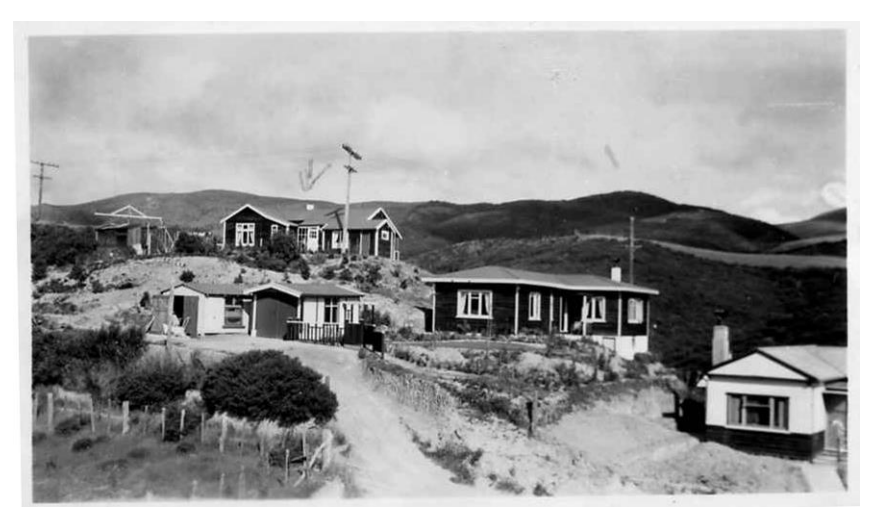
The Fitt and Wright homes in about 1943

"On the corner across the fence and above the stream, was a paddock with a big communal garden," said David. "It was a big vege garden. Below the garden was a row of trees and below them was the stream. When working in the garden we discovered the button of an old Armed Constabulary tunic and took it to the Dominion Museum. During WWII we dug in a bunker below the gardens which acted as an air-raid shelter. How safe it was, was never tested, luckily."